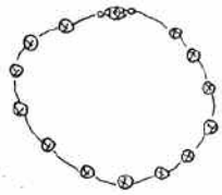
Single Strand Floating Necklace