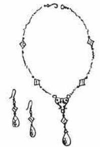
"Y" necklace (beads and chain) with matching drop earrings