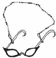
Beaded Eyeglass Holder