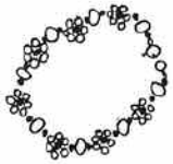
Daisy Chain Bracelet or anklet