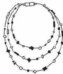
Triple Strand Floating Necklace