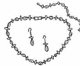
Single-strand beaded necklace, bracelet, earring set