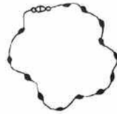
Knotted Silk Necklace