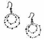
Double Hoop Earrings